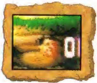
Another Hit And He's History